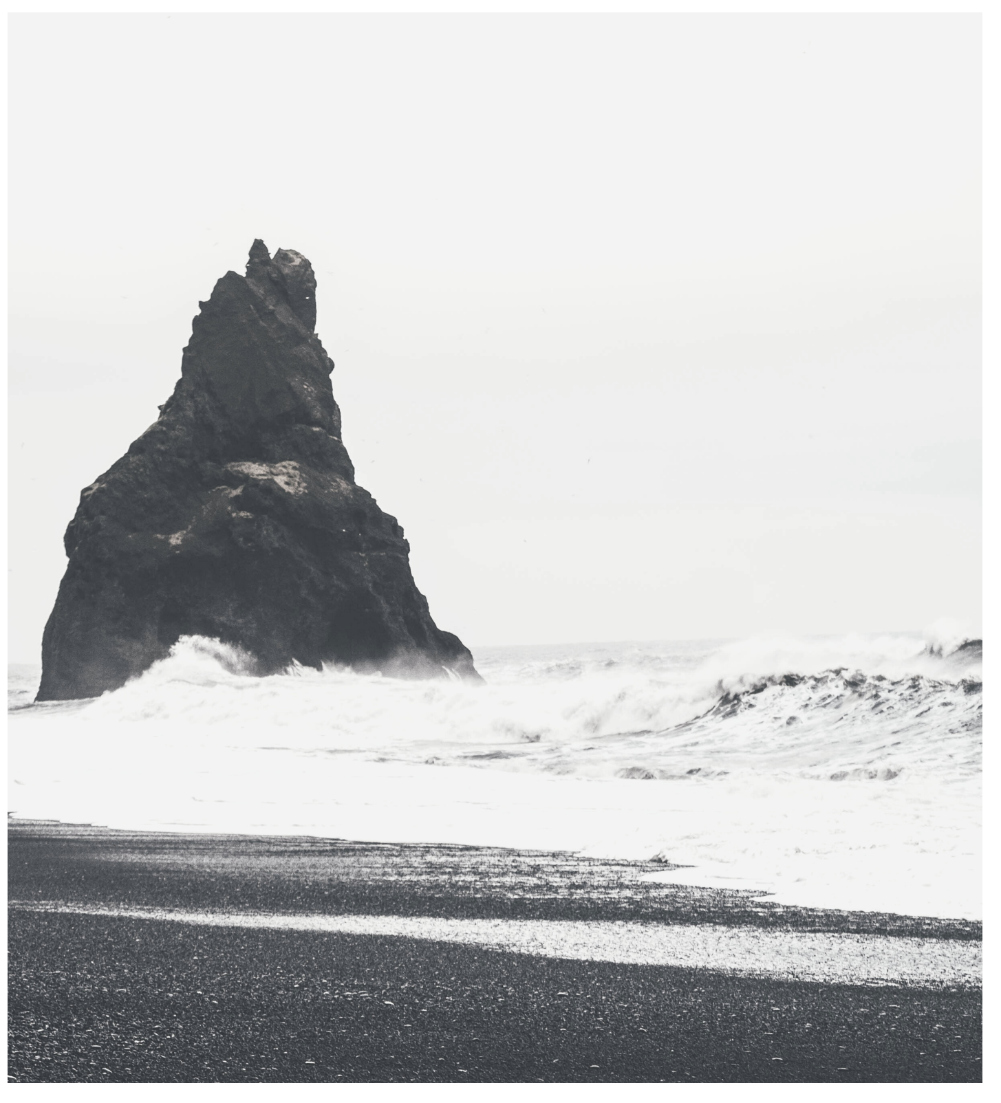
LETTERS FROM JESUS - THYATIRA